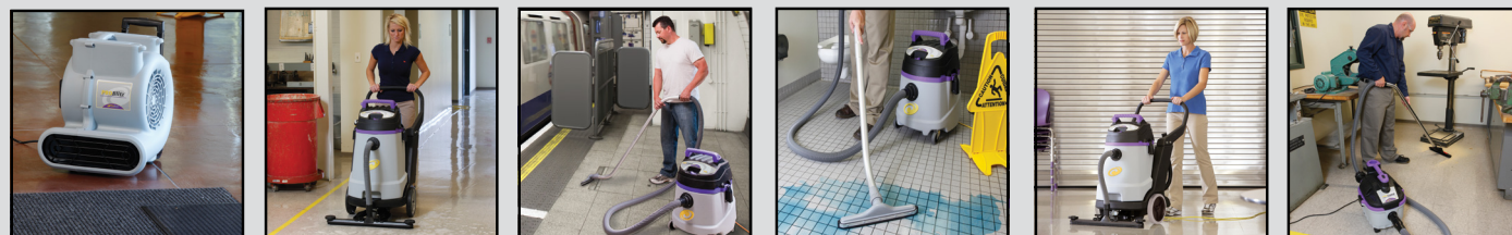
Entryway / Walk Off Mat